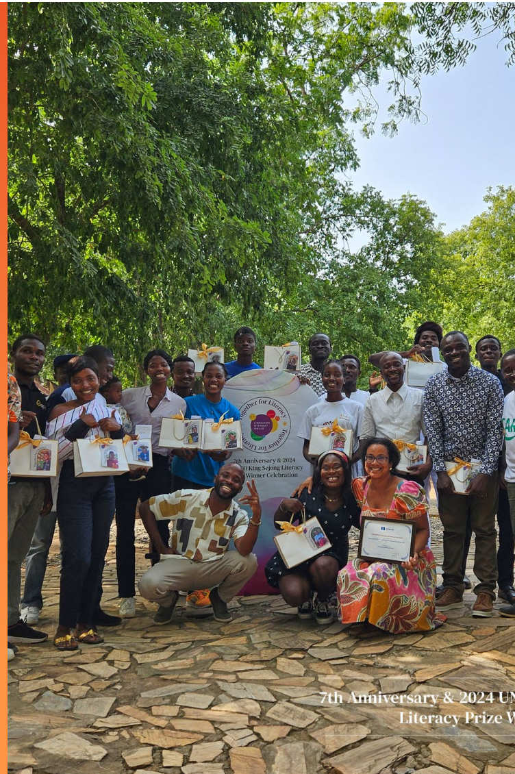
7th Anniversary & 2024 UNESCO King Sejong Literacy Prize Winner Celebration

We also used the occasion to celebrate an incredible milestone: the 7th anniversary of Libraries Without Wall! Congratulations to all our volunteers, team and supporters! We are grateful for our community of volunteers and friends who have worked tirelessly to make books, literacy, and education accessible to all. This journey has been made possible by their passion, commitment, and unwavering belief in the power of education.